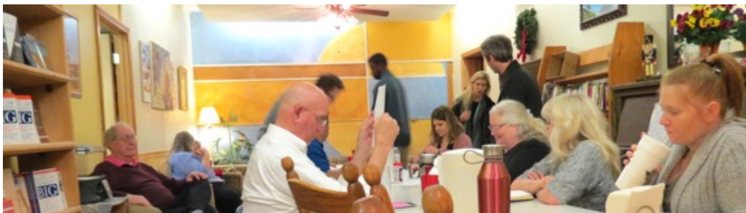
Directors, Area Directors, and Doctors at 2020 General Assembly