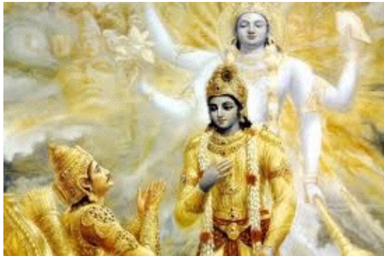
The Bhagavad Gita

Arjuna Speaks: Out of compassion you have taught me the supreme mystery of the Self. Through your words my delusion is gone. You have explained the origin and end of every creature, O lotus-eyed one, and told me of your own supreme, limitless existence.